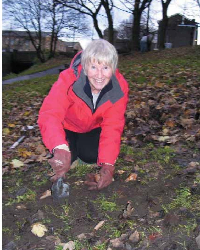
A Glossopdale Ranger plants spring bulbs at Harehills