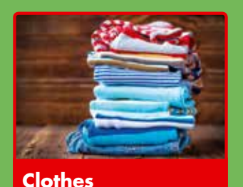
Clothes can be recycled in our red textile bags or given to charity for reuse.