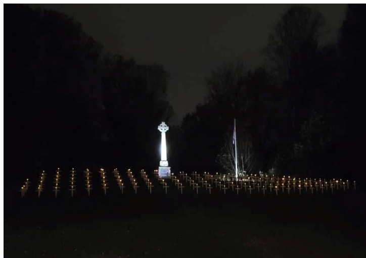
Remembrance Crosses in the Park