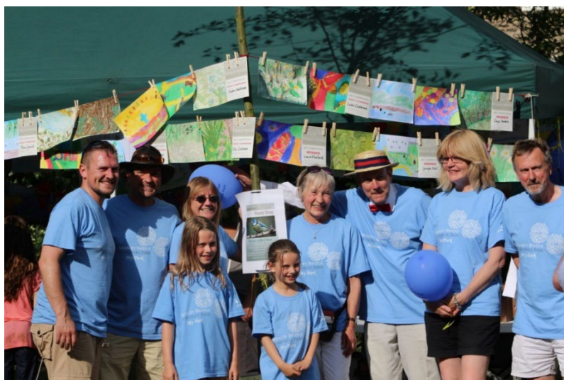
Friends of Memorial Park at the Park Open Event

Following the delivery of the restoration and renovation of the park, the group was reinvigorated with new members and are now integral to the protection and development of the park, ensuring that the long-term sustainability of the park is managed with local community input.