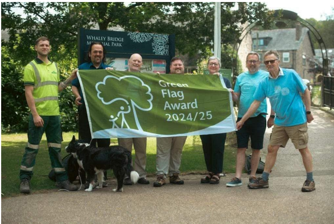
Celebrating the Green Flag Award with the new Ranger and Friends Group

In summer 2024, the existing Ranger moved on and a new Ranger was appointed. They have continued to work with and support the Friend's group on various projects including cleaning and staining some of the benches and the creation of a Japanese Garden. The Ranger is also keen to expand the planting in the park for pollinators and other insects and invertebrates and has developed a plan for spring 2025.