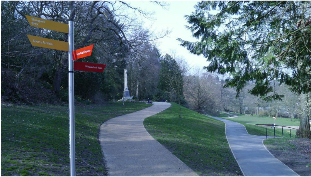
Signage in the park