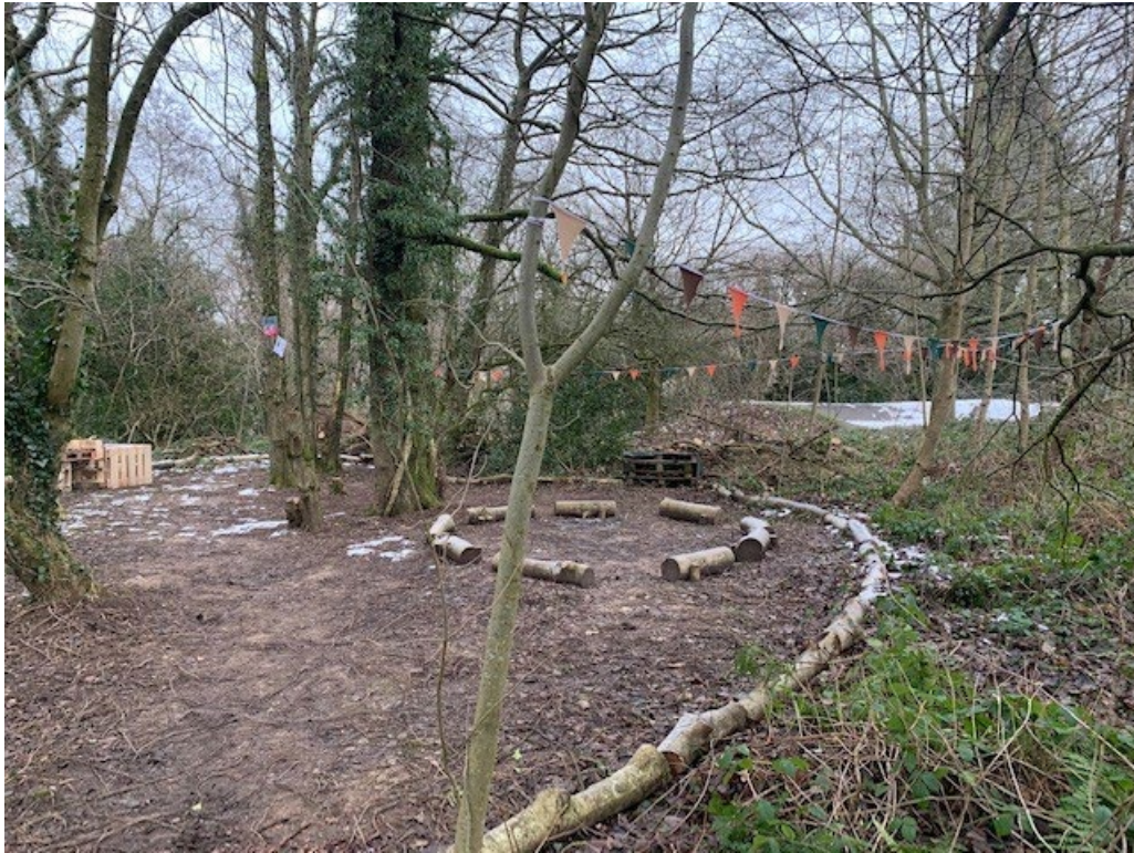
Entrance to new Forest School Area