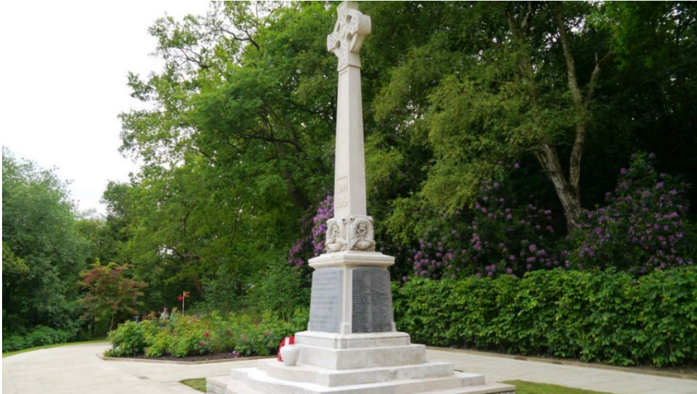
Refurbished cenotaph and memorial area 2014