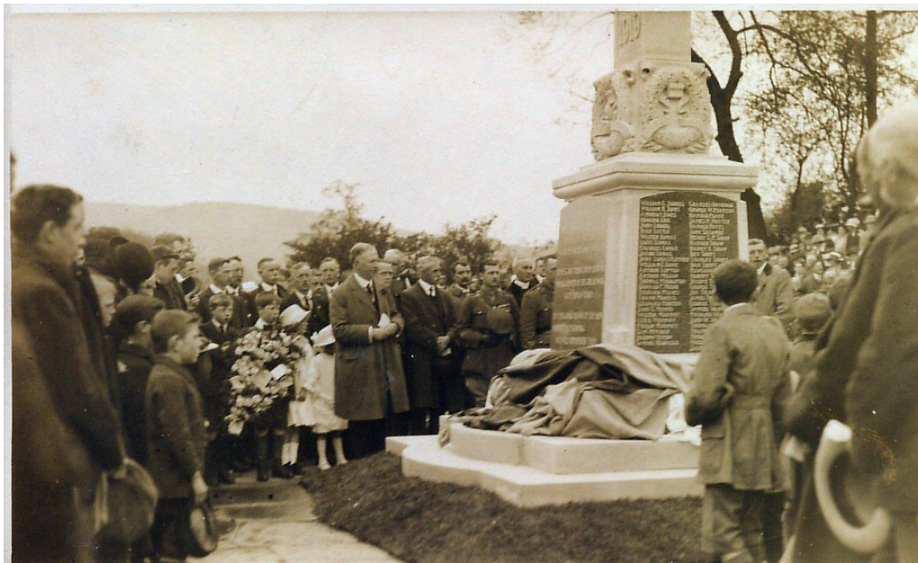
Unveiling of the cenotaph 4 th May 1921