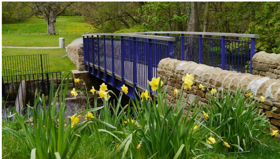
New bridge crossing the River Goyt

The park has a very important woodland habitat which is a key feature of this open space, and is carefully monitored and managed by the council and AES. The River Goyt also runs along the eastern boundary providing important waterside habitats. Toddbrook Reservoir sits above the park on its eastern edge and although owned and managed by the Canal and Rivers Trust, it is very much seen as part of the park landscape with established linking walks from the park to the reservoir and beyond.