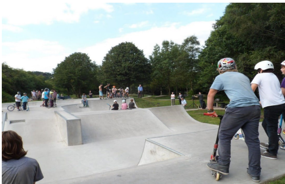
New skatepark installed in 2012

This facility is also managed and maintained by Whaley Bridge Town Council and has to be booked for use, but is open to community groups on a pay as you play basis or as a training facility by the football club. Taxal and Fernilee Primary School use it regularly during the week for PE lessons and also after school activities.