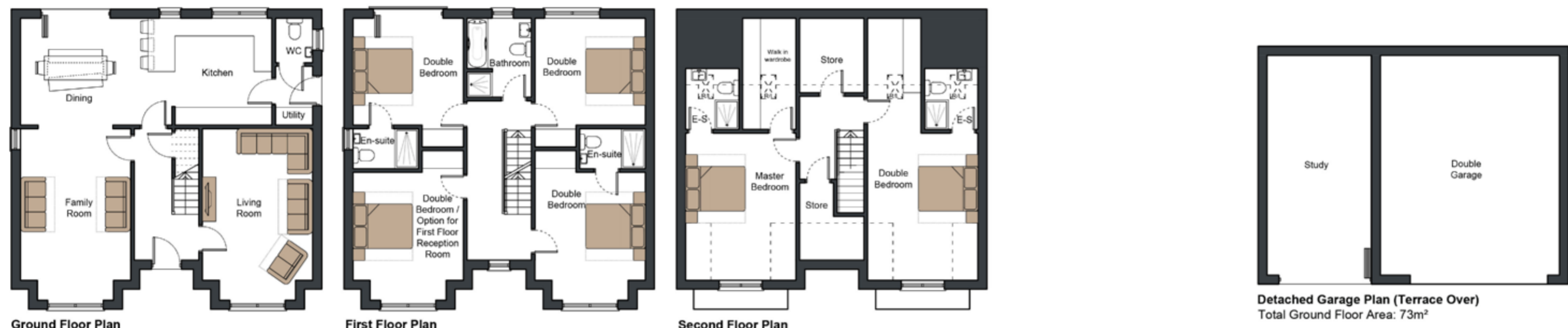
House Type C (6 Bedroom) Total Area: 257m² plus garage