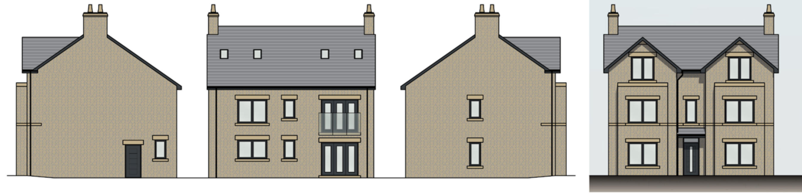
02 Proposed Elevations 23 Scale 1:100 @ A1