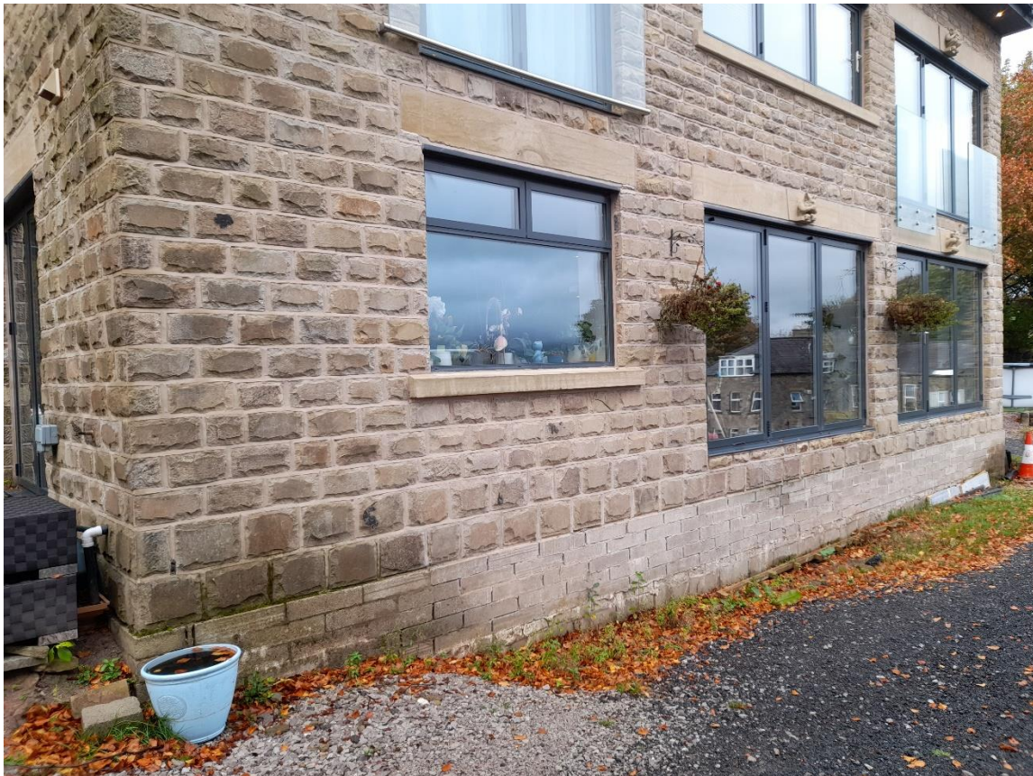
9 Patio windows / bi-folding doors on main elevation (east), 27/10/2022