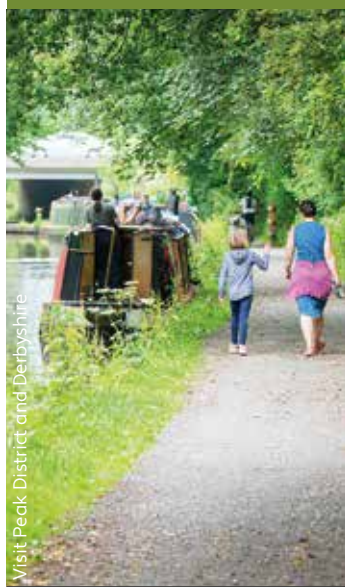
Visit Peak District and Derbyshire

To find out about health benefits of stopping smoking, the money you can save, and useful tools visit: www.livelifebetterderbyshire.org.uk