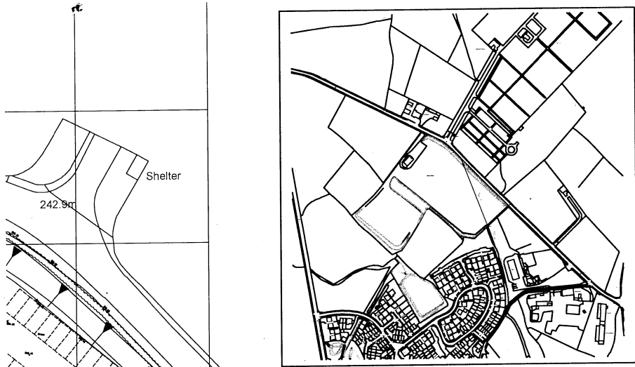
SITE LOCATION @ 1:10,000 scale @ A4